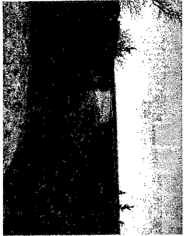
Elden F. Curtiss Youth Camp and Retreat Center Mission Statement

The Elden F. Curtiss Youth Camp and Retreat Center of the Archdiocese of Omaha exists to complement the faith formation activities of our parishes and schools in ministering to young people and their families. In a uniquely Catholic environment, it helps young people grow closer to Christ and to grow deeper and learn more about their Catholic faith, and to come to a deeper understanding of their giftedness for service in the life and mission of the Catholic Church. We accomplish this by offering faith-filled, challenging and fun programs and activities that promote personal and spiritual growth within God's natural setting of beautiful wooded hills on the Elkhorn river.